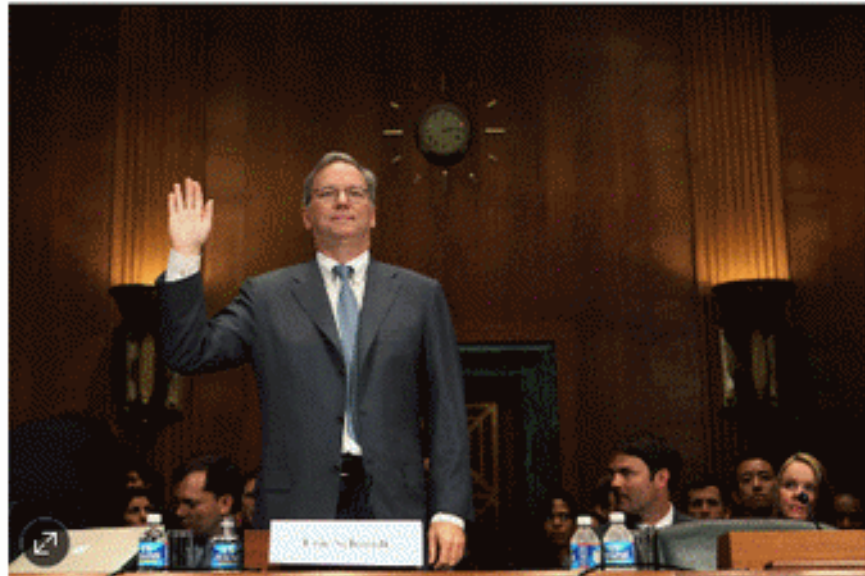
Google's Eric Schmidt testified in 2011 about the Internet giant's business practices and defended how it displayed search results.

Key FTC staff wanted to sue Internet giant after finding 'real harm to consumers and to innovation'